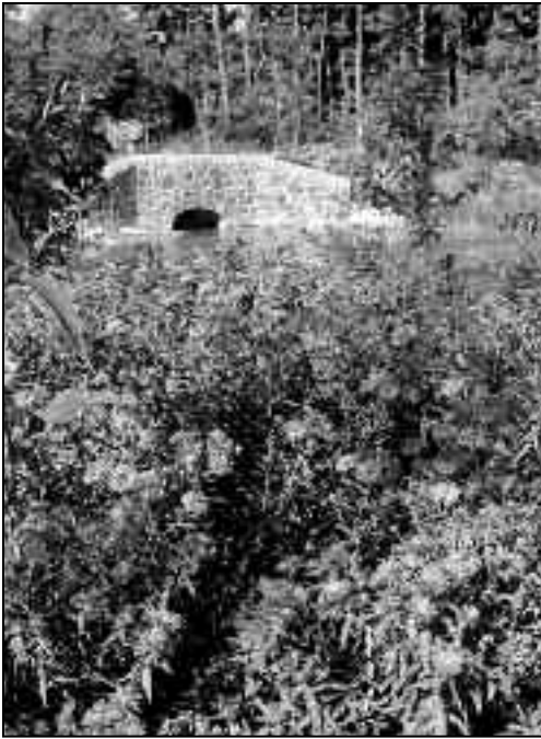
Preservation of South Richmond's unique open space areas is a key goal of the Bluebelt.

scattered pattern of auto-oriented settlement. In 1967, developer and visionary James Rouse attempted to do better and proposed a Columbia, Maryland-style new town in the largest concentration of City-owned property. The plan featured clustered housing and high-density town centers. It prompted intense public opposition and was disapproved, leading to the establishment in 1975 of the Special South Richmond Development District in the Zoning Resolution of the City of New York.