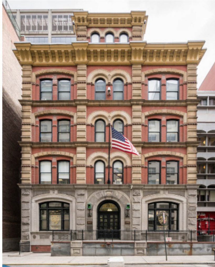
Location of Justice: Structures